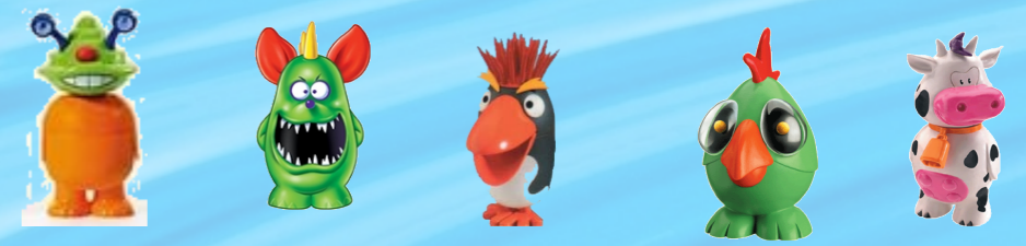
Marty (Chocolate) Friky (Strawberry) Punky (Vanilla) Kuaky (Chocolate) Vacky (Vanilla)